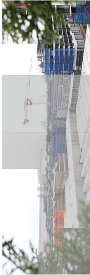
00 Superposed Stage 1 DA View