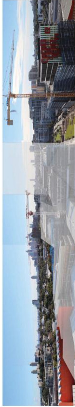
03 Superimposed Stage 1 DA View