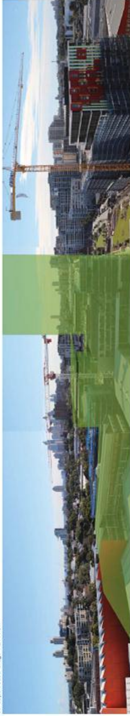
04 Proposed Stage 1 DA View