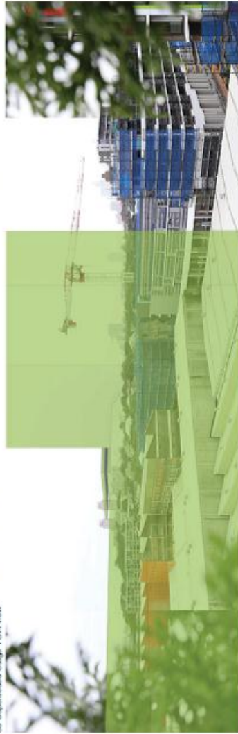
04 Proposed Stage 1 DA View