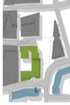
06 Location of View