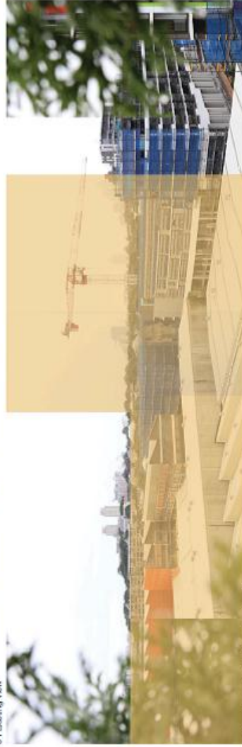
02 Development Control Plan Envelope View