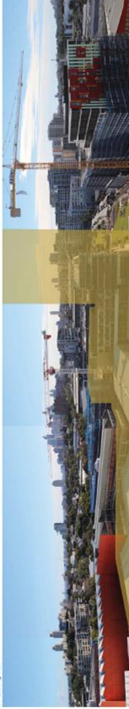
02 Development Control Plan Envelope View