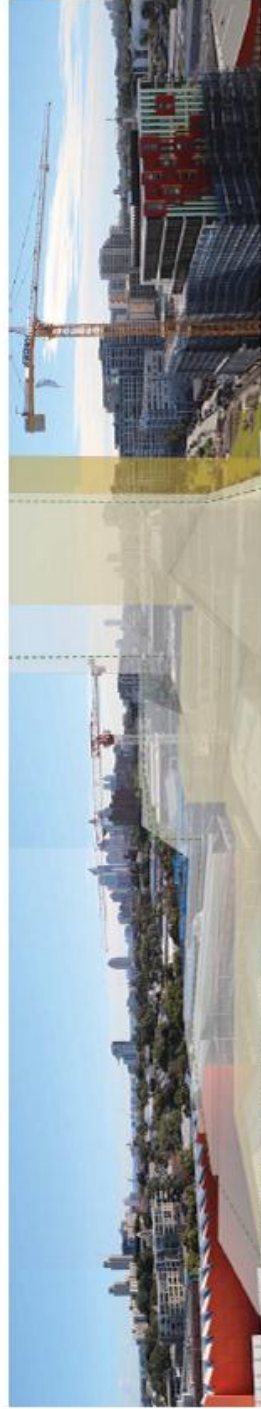
00 Development Control Plan and Superseded Stage 1 DA Envelope Comparison Defined the Indicated Proposed Stage 1 DA envelope.