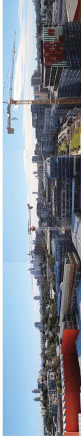
01 Existing View