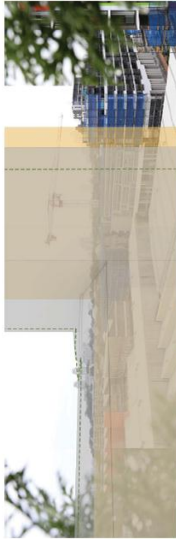
06 Development Control Plan and Superadded Stage 1 DA Envelope Computation Defined the Indicated Proposed Stage 1 DA envelope.