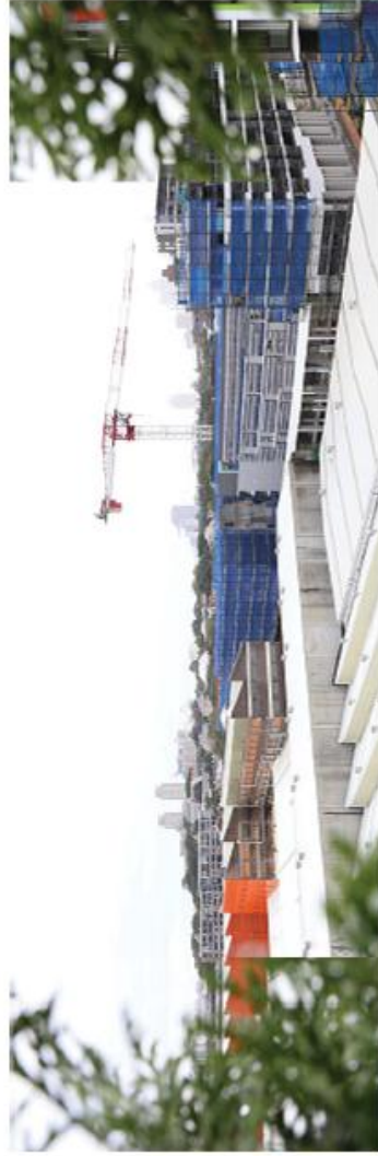
01 Existing View